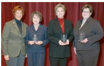
Recipients of the 2007 Alumni Achievement Award and the 2007 young Alumni Achievement Award