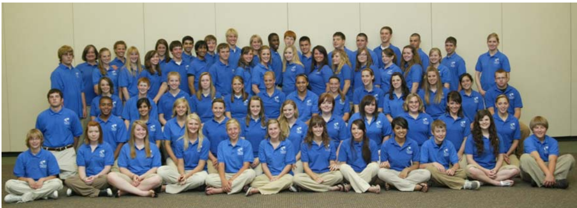
2009 Young Leaders of Character