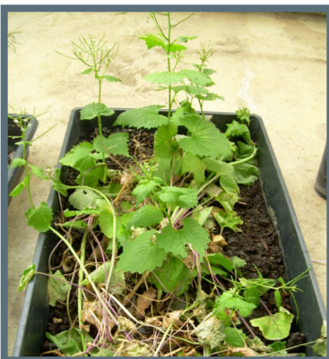
Zombie garlic mustard grows for weeks after being pulled from the ground."

Garlic mustard ( Alliaria petiolata ) is one of the more noxious invasives in Iowa woodlands and savannahs. The Des Moines Parks and Recreation Department (DMPR) has worked for years on removing the species from locations throughout the city, often using large groups of volunteers to physically uproot the plants from a site. Volunteers usually put plants into large plastic bags and dispose of them in landfills, because there is concern from past research that garlic mustard might be able to set viable seed if left on the ground to decompose. Inger Lamb of DMPR needed to determine how likely seed setting was for young plants, because bagging presents many difficulties for DMPR, including waste disposal, loss of nutrients, and most importantly difficulties for volunteers as they carry large bags through thorny underbrush. The four seniors in this group removed plants at various life stages and tested the plants' ability to set viable seed under multiple scenarios. Students found that garlic mustard was quite tenacious, living up to four weeks in the Drake greenhouse even after being pulled from the ground, as long as plants were kept moist. However, if roots and stems were separated after plants were pulled, then plants died before producing seeds. This simple strategy is likely to save DMPR volunteers significant time, allowing them to restore more land.