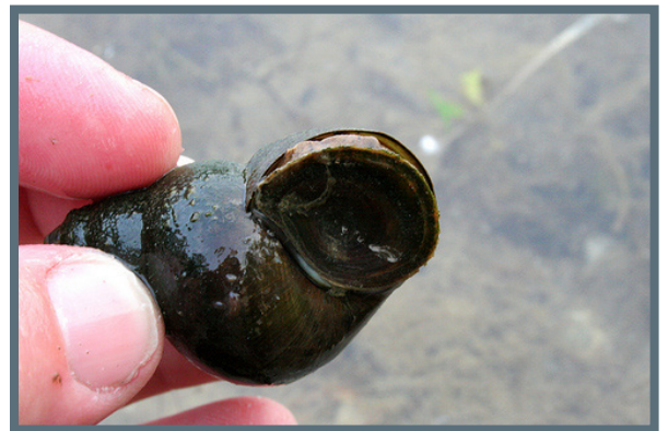
The Chinese Mystery Snail, Bellamya chinensis .