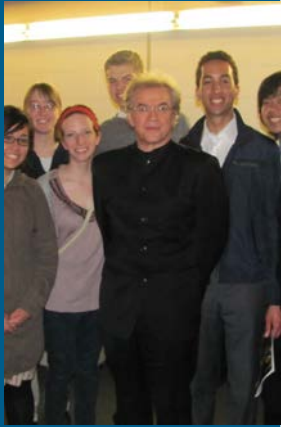
Drake students with Osmo Vanska

“The band’s performance, featuring works by Freer, Puckett, Wilson, Grainger, Sousa and Mackey, was met at its conclusion by a three curtain-call standing ovation by members of the association.”