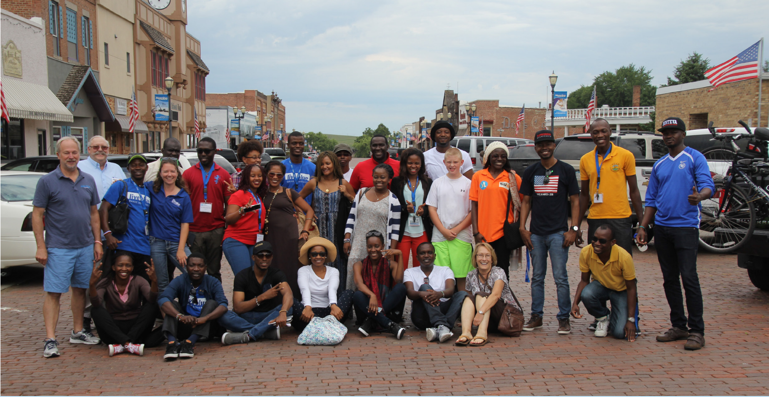
YALI students touring main street in Manning, Iowa.