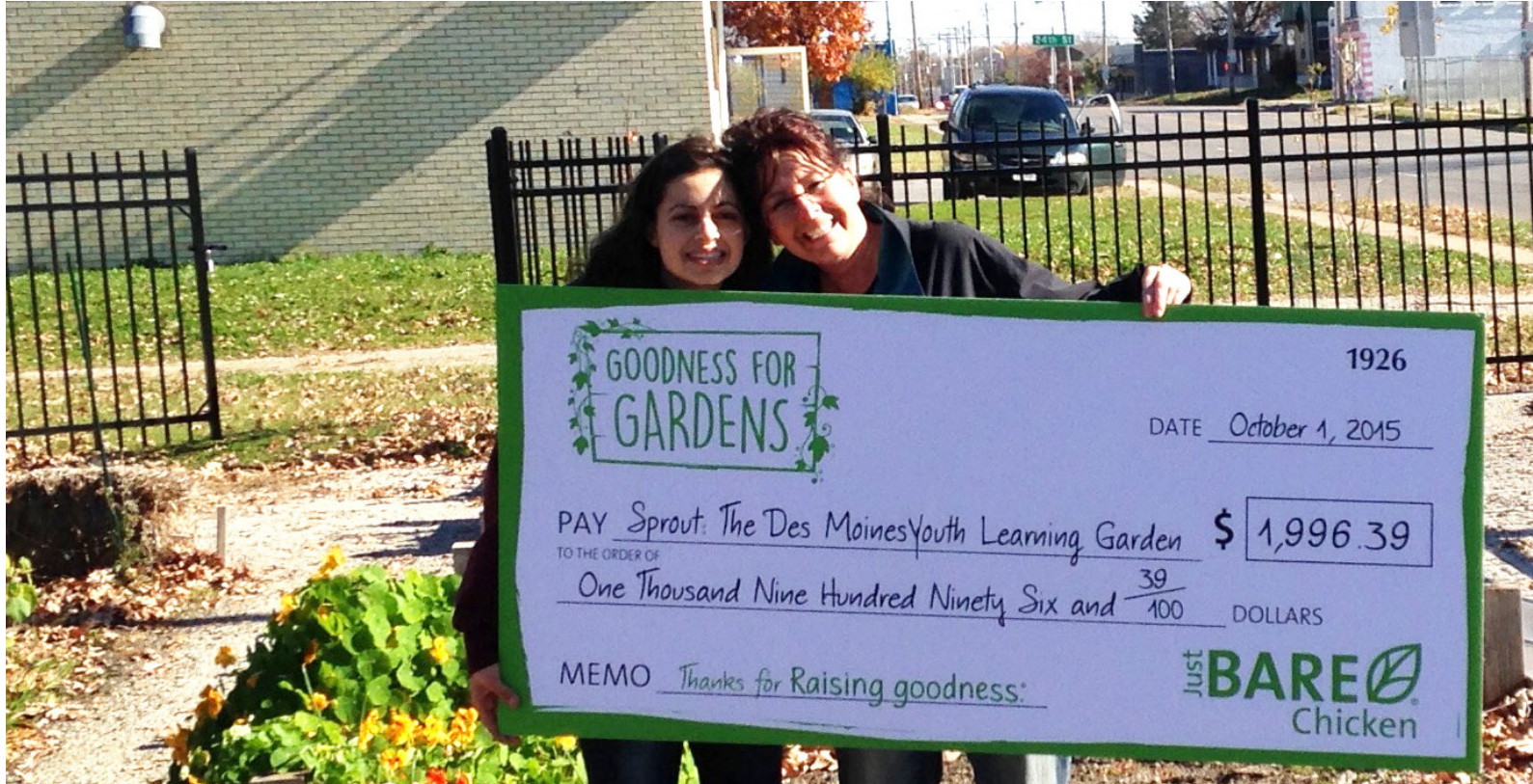
Sprout: The Des Moines Urban Youth Learning Garden receives check to help continued growth.