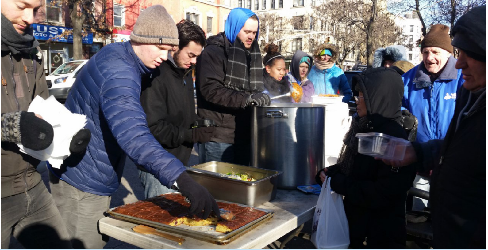
Students serving the homeless during a J-term course to New York City to learn about urban poverty.