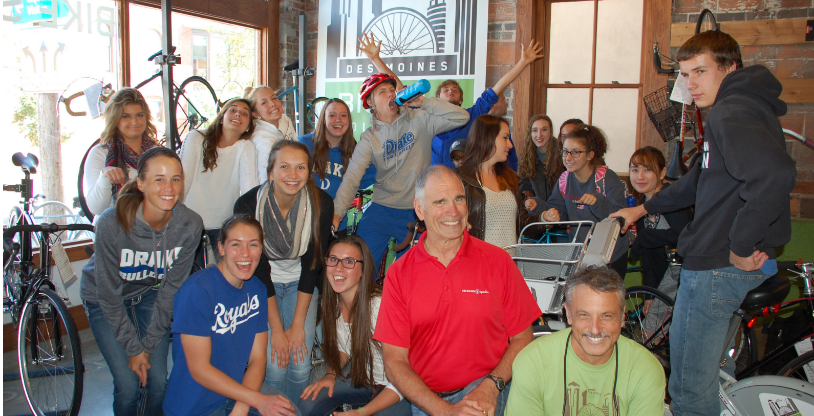
LEAD students worked with the Des Moines Bike Collective to install a bike library on campus.