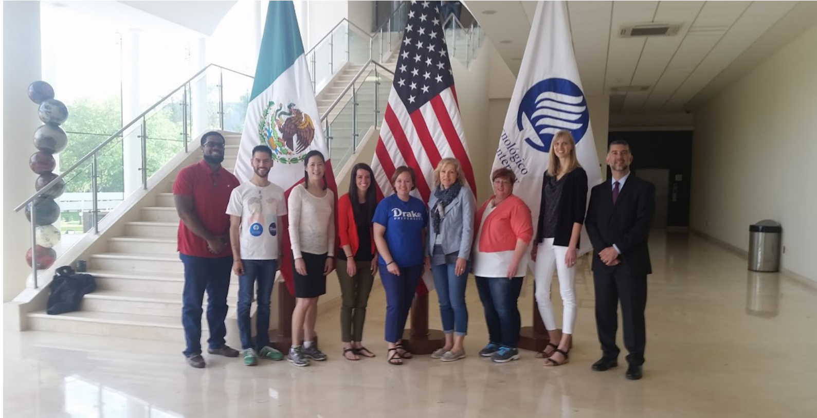
The first Faculty/Staff Global Service-Learning Seminar traveled to Tecnológico de Monterrey in March 2016.

10 J-Term programs and 4 summer programs in the 2015–2016 academic year 9 travel seminars had a service-learning component 145 students participated in a service-learning experience on travel seminars to Uganda, the Bahamas, Belize, Chile, Ghana, Mexico, Rwanda, New York and Hawaii