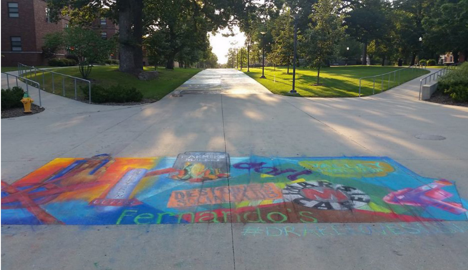
Drake students promoted local businesses through #DrakeLovesDSM social media campaign during welcome weekend.