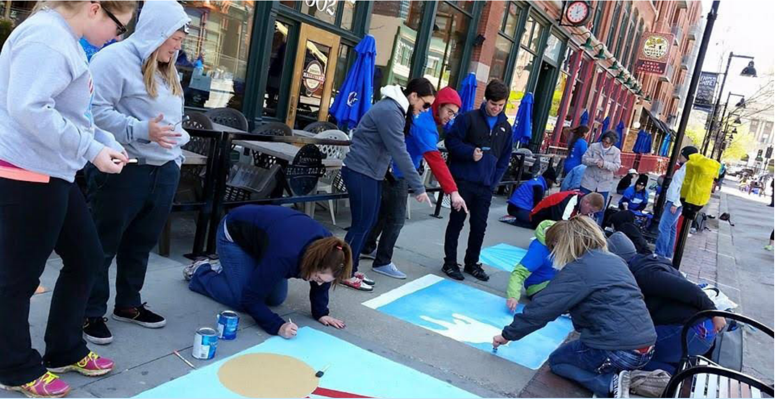
Community members participate in Downtown Street Painting along Court Avenue.