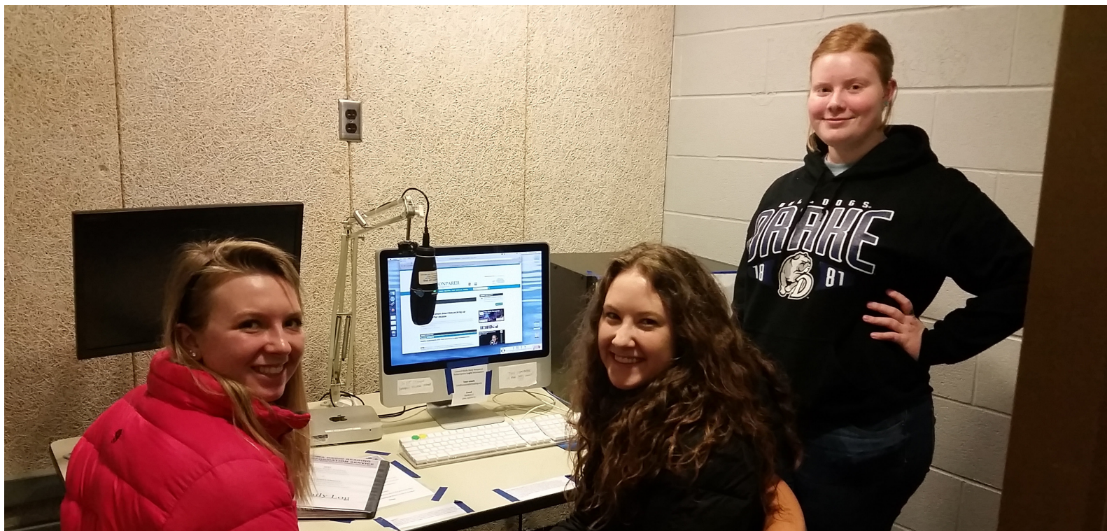
Members of Delta Gamma Fraternity being trained to read for IRIS.