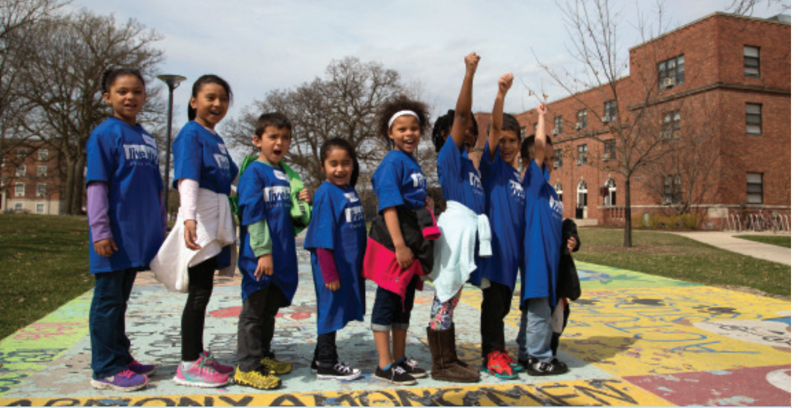
Findley students on Drake University's campus participating in Going to College Day.