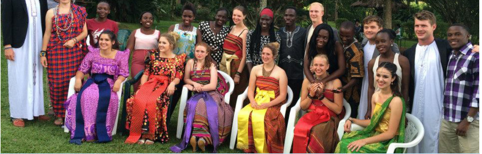
J-Term students with fellow Ugandan students.

—Katherine Walther '17, Uganda travel seminar participant